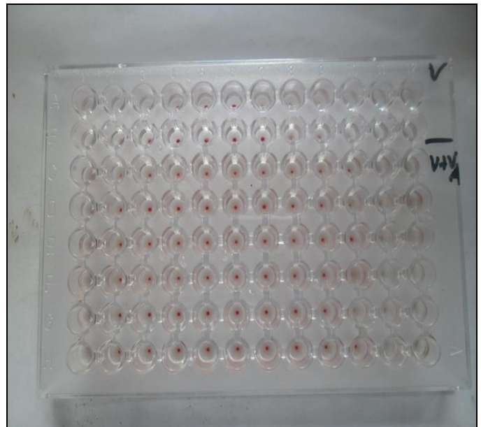
Figure1 (b): Vaccinated and supplemented

The I-2 antibody titres in group I, II, III and IV were 2^{7.1} , 2^{9.1} , 2^{1.2} and 2^{1.1} , respectively. There were significant difference in antibody titres between chickens in group II and I.